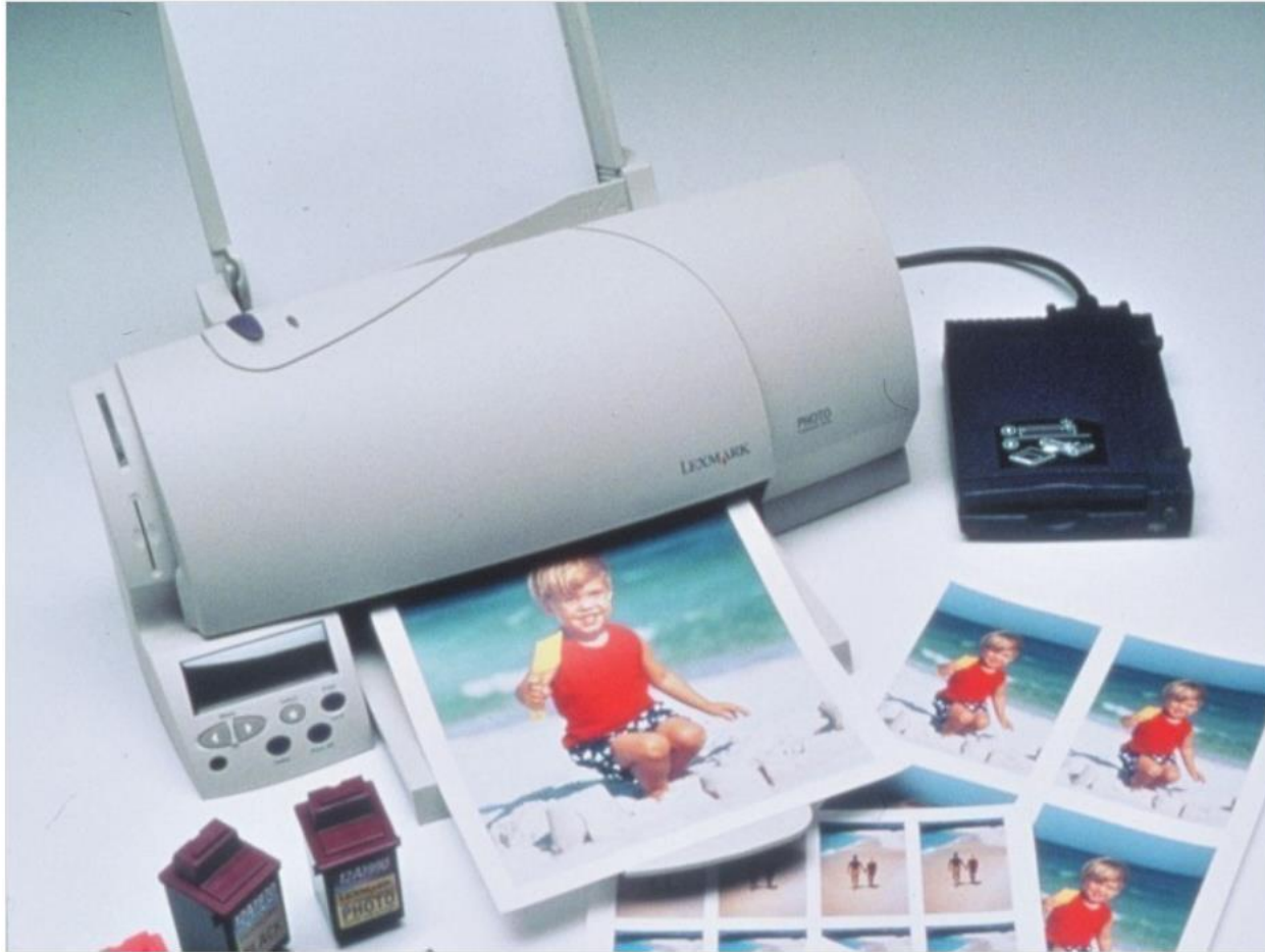
Lexmark Photo Jetprinter 5770

Lead EE: Lexmark 5770 – First Generation Photo Printer