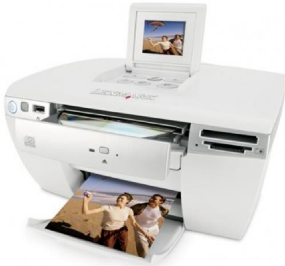
Lead EE: Lexmark P450 Photo Printer with CD ROM Burner