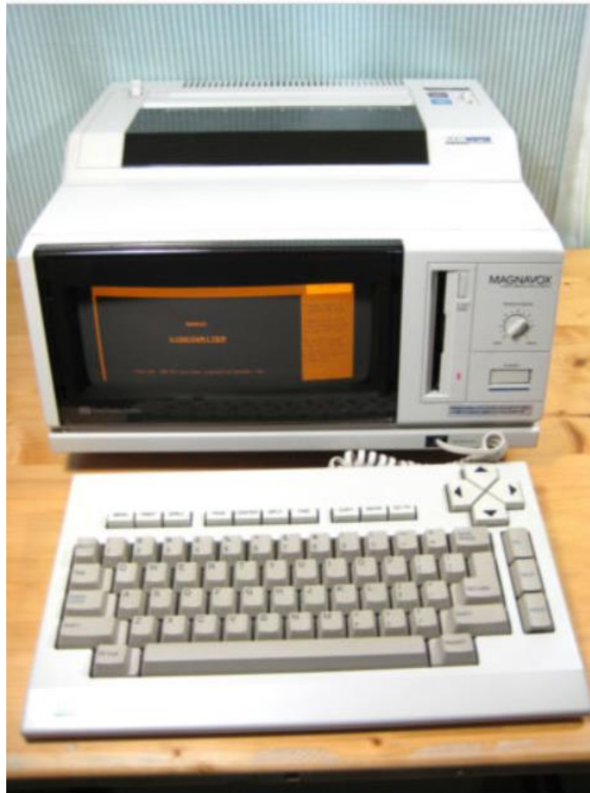
Lead EE: Magnavox VideoWriter – First Generation Portable Word Processor