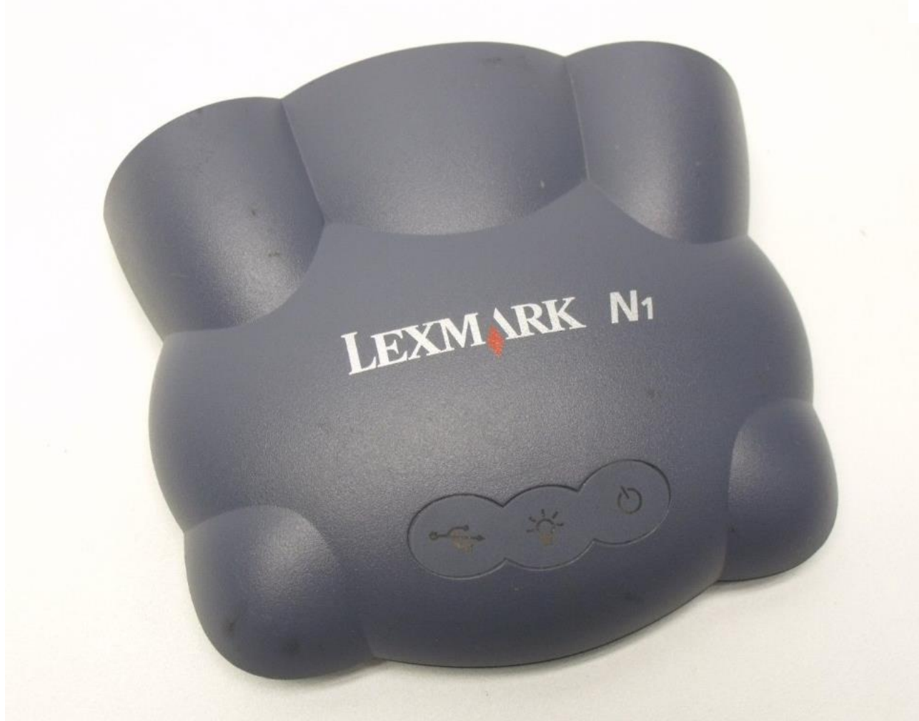
Lead EE: Lexmark N1 Inkjet Ethernet Adapter. - First Generation Inkjet Network Adapter