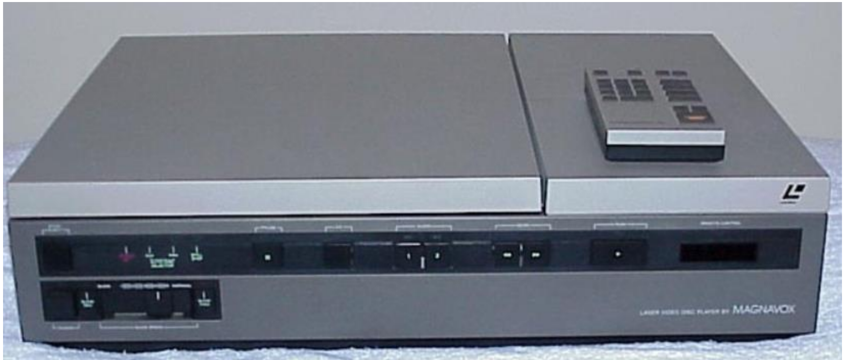
Staff EE: Magnavox Laser Disk Player