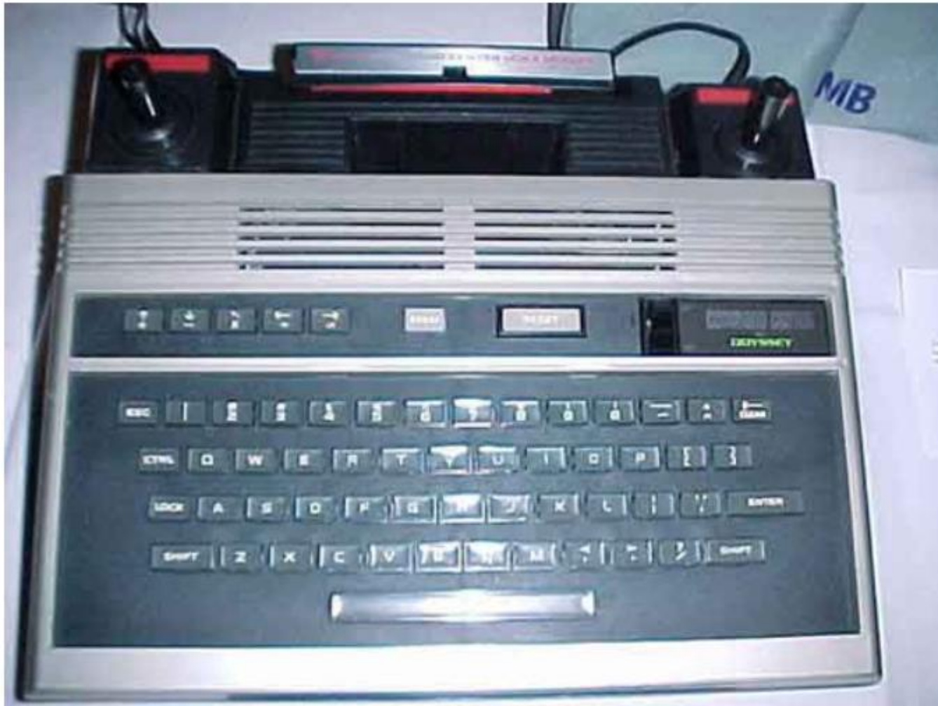
Staff EE: Magnavox Odyssey 3 Video Game Console